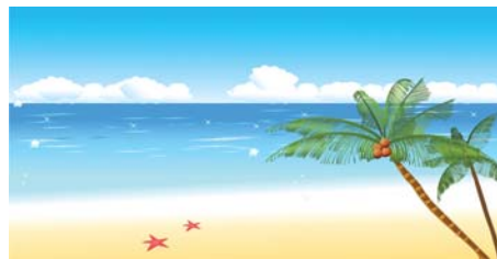
Walter Johnson After Prom Breakfast 2009

Dear Walter Johnson High School Cluster Community,